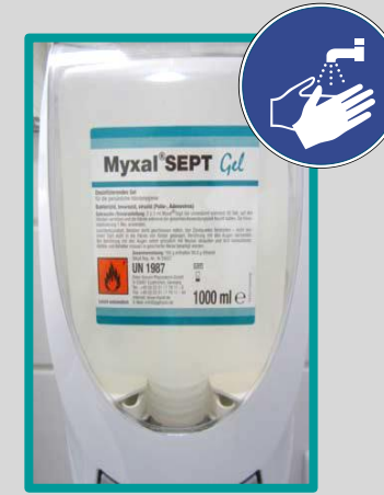
Disinfection at least 30 sec