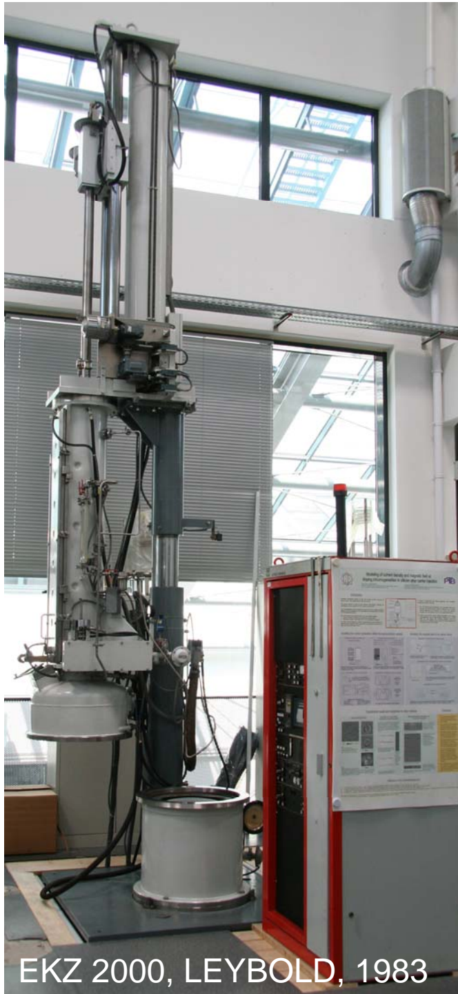
EKZ 2000, LEYBOLD, 1983

Ready for first test runs with Si in 14 inch crucible Then first test runs with Ge